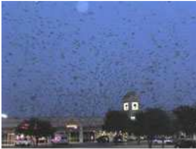
Pre-Migratory Roost Lewisville, TX 2004 Click for larger view

It first appeared at Wings In Flight and is used here with their permission.